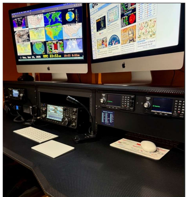
The day he received his GENERAL upgrade